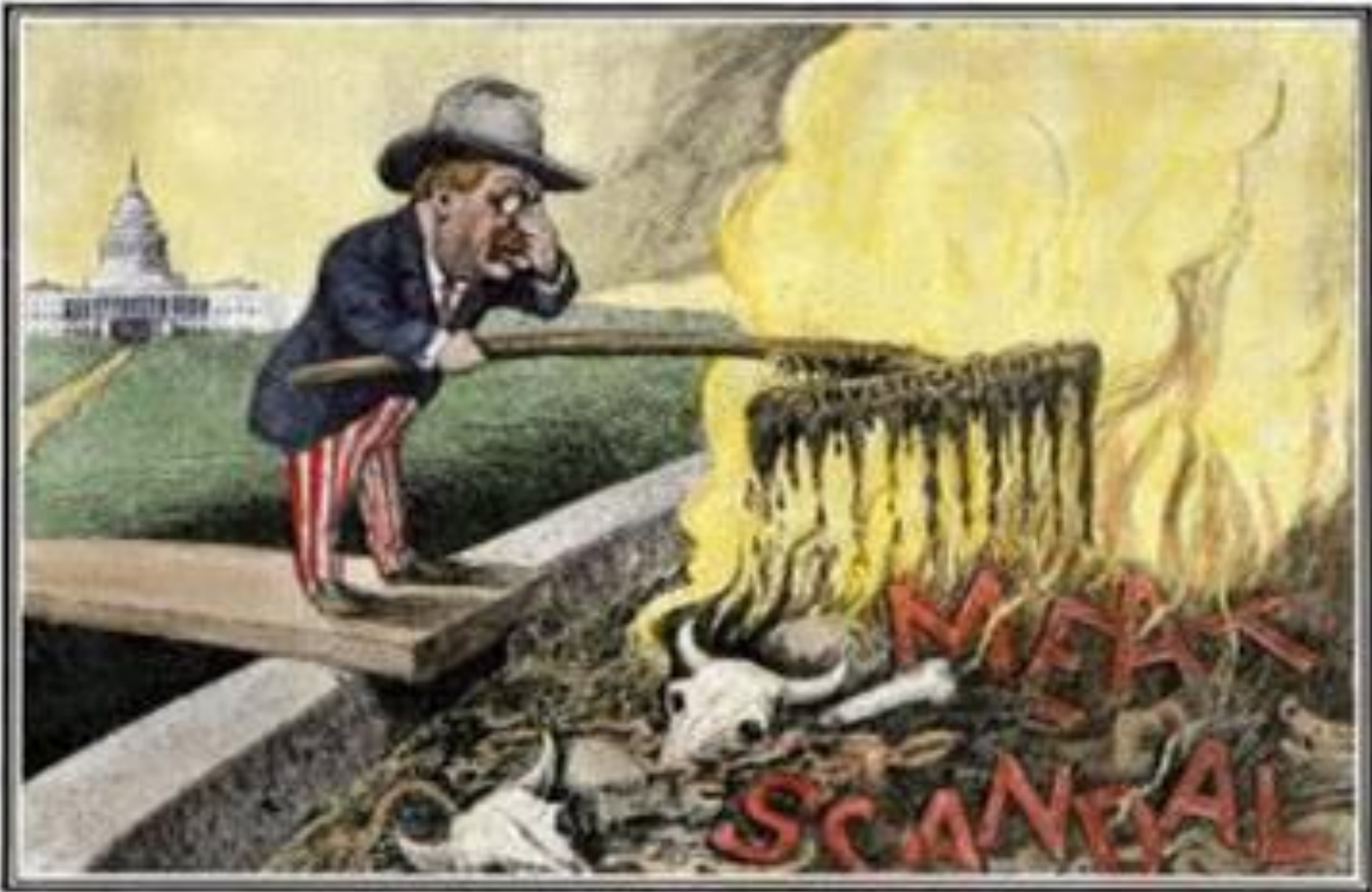
A NAUSEATING JOB, BUT IT MUST BE DONE