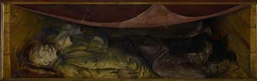
Otto Dix, Der Krieg , 1929-1932; https://albertinum.skd.museum/en/exhibitions/archive/der-krieg/