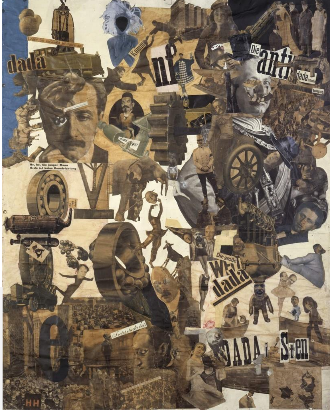
Hannah Höch, Cut With the Kitchen Knife Through the Last Weimar Beer Belly Cultural Epoch of Germany , 1919-1920

https://en.wikipedia.org/wiki/File:Hoch-Cut_With_the_Kitchen_Knife.jpg