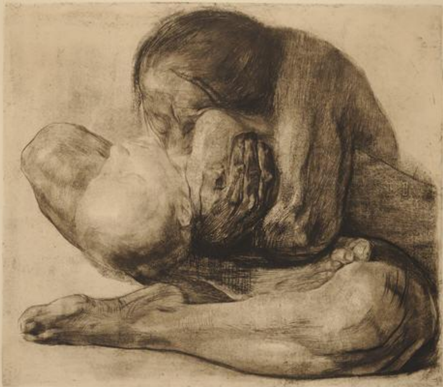
Kaethe Kollwitz, Woman with dead child , 1903