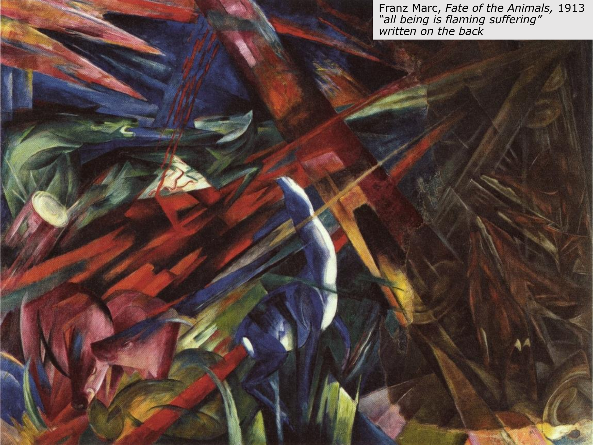
Franz Marc, Fate of the Animals , 1913 "all being is flaming suffering" written on the back