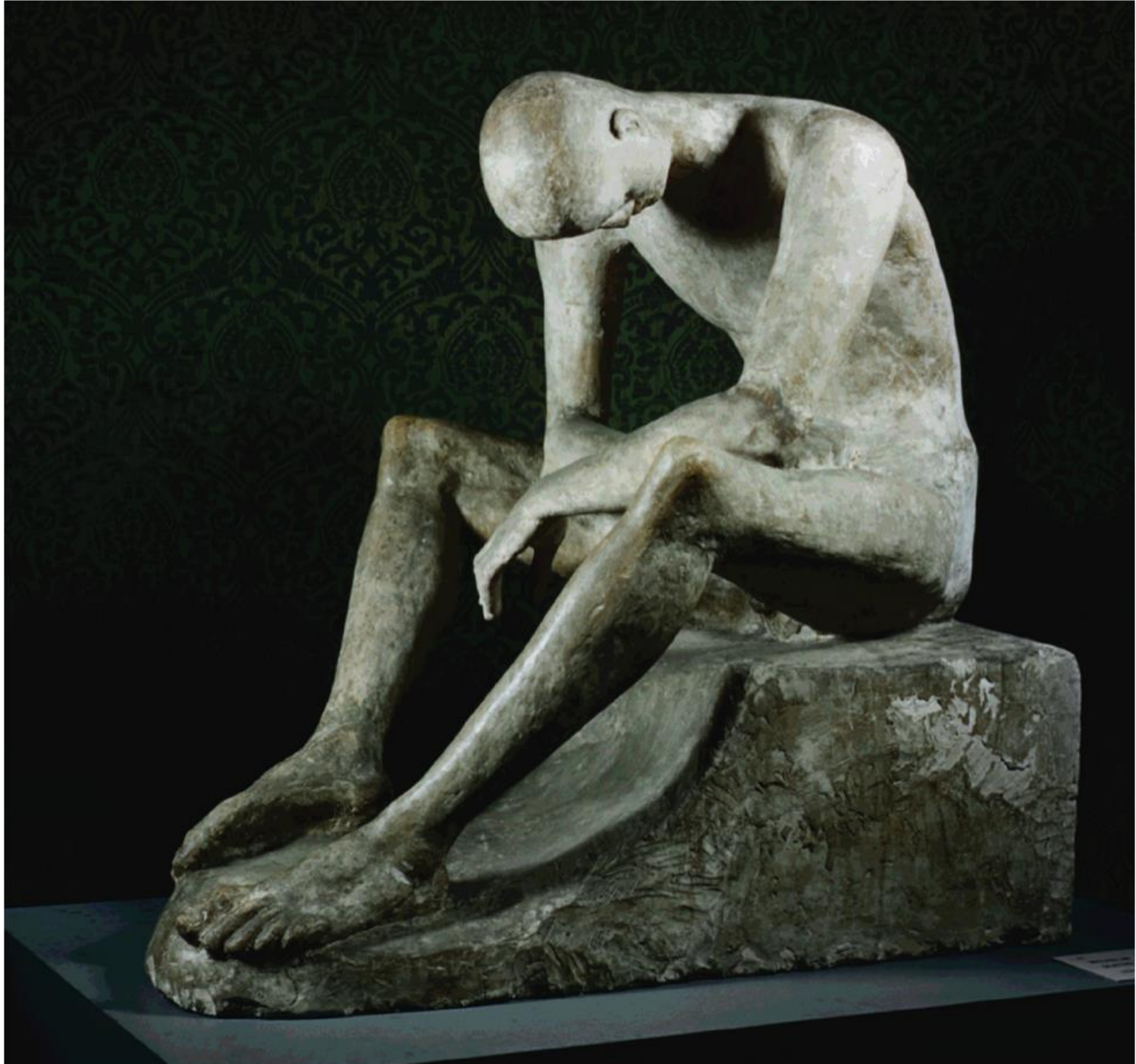
Wilhelm Lehmbruck, Seated Youth , 1917