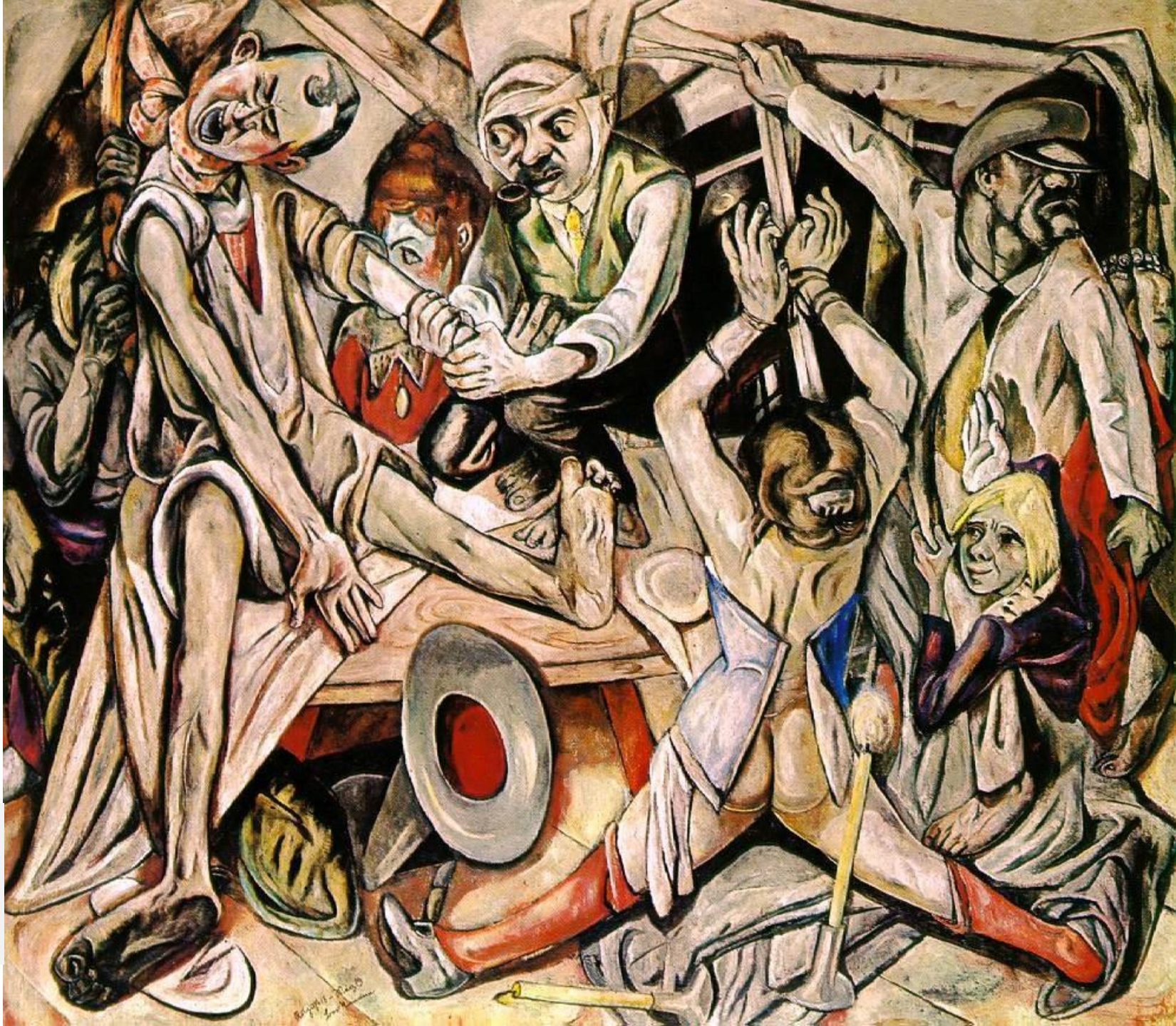
Max Beckmann Night , 1918-1919