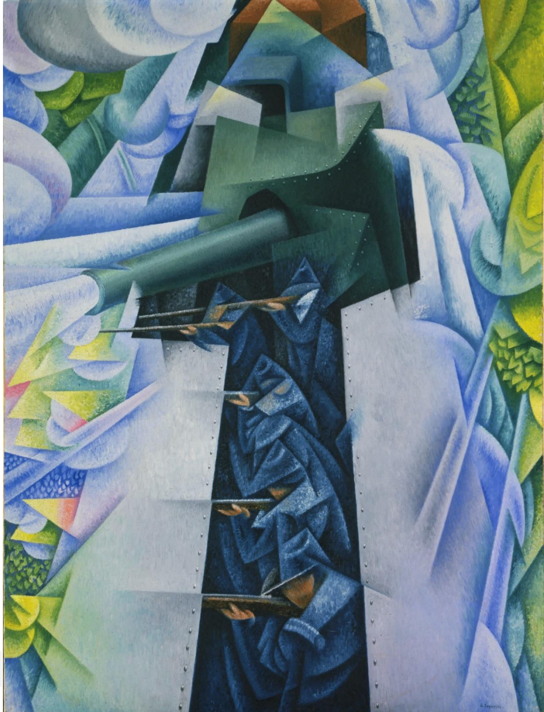
Gino Severini, Armored Train , 1915